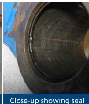
placement in bore