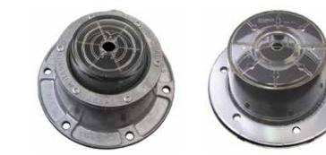
347-4009 Trailer 640-0001 Trailer

STEMCO Hubodometer hub caps provide ease and convenience when installing our mechanical or electronic DataTrac® Hubodometers. The 347 series aluminum hub cap is mounted with a hubo window while the 640 series is a full grilamid Hubodometer hub cap with a metallic flange. Both allow for mounting of the Hubodometer directly through the center of the hub cap.