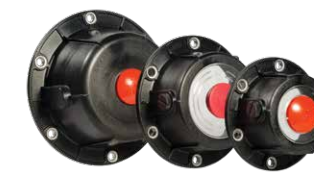
368-4195 Trailer 363-4009 Trailer 366-4024 Steer

The Defender hub cap is 100% corrosion-free, with stainless steel reinforcement inserts. It achieves longer wheel-end life using a magnetic plug that pulls abrasive material away from critical components. An exception chemical bond between the hub cap and window ensures a strong seal and no leaks.