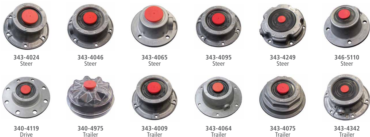
343-4024 Steer 343-4046 Steer 343-4065 Steer 343-4095 Steer 343-4249 Steer 346-5110 Steer 340-4119 Drive 340-4975 Trailer 343-4009 Trailer 343-4064 Trailer 343-4075 Trailer 343-4342 Trailer

The traditional aluminum series 340 and 343 provide durability with the trademark red plug to allow venting of the hub cap. Using cast aluminum for constructing the hub cap body prevents warpage and provides superior durability and heat-dissipation properties. The trucking industry recognizes STEMCO hub caps as the benchmark.