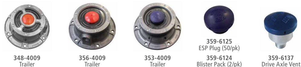
348-4009 Trailer 356-4009 Trailer 353-4009 Trailer 359-6125 ESP Plug (50/pk) 359-6124 Blister Pack (2/pk) 359-6137 Drive Axle Vent