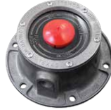
Integrated Sentinel Hub Cap