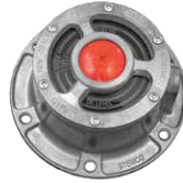
Sentinel Hub Cap