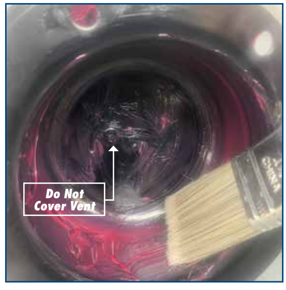
Figure 4: Paint in the inside of stamped steel hub cap with grease